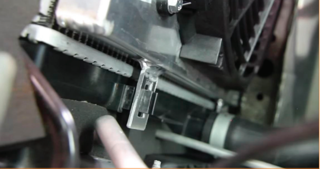
29. Connect the electrical harness to the fans.