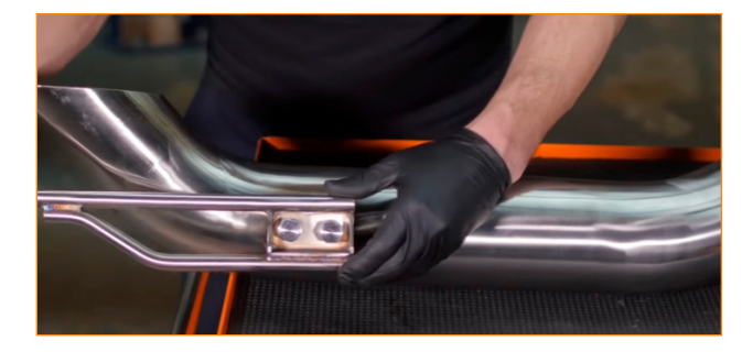
06. Slip a clamp over the straight section you just installed. (1x exhaust clamp)

05. Locate the long section of exhaust, hardware, and bolt-on hanger in your kit. Slip the washers over the bolts and install the hanger to the exhaust system as shown here. Leave the bolts loose for now; we will tighten them later when adjusting the exhaust fitment. (2x 17mm bolts, 2x lock washers, 2x flat washersl