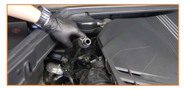
2. Slide the provided aluminum spacer over the

Compress the clamp on each end of the PCV hose. Separate the PCV hose by sliding the ends off their respective ports. (2x spring clamps)