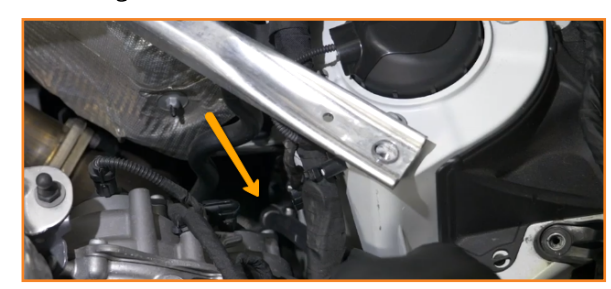
10. Lift the ECU where the bolt was removed and slide one end of the catch can bracket underneath.

9. Feed the drain valve and hose along the side of the engine.