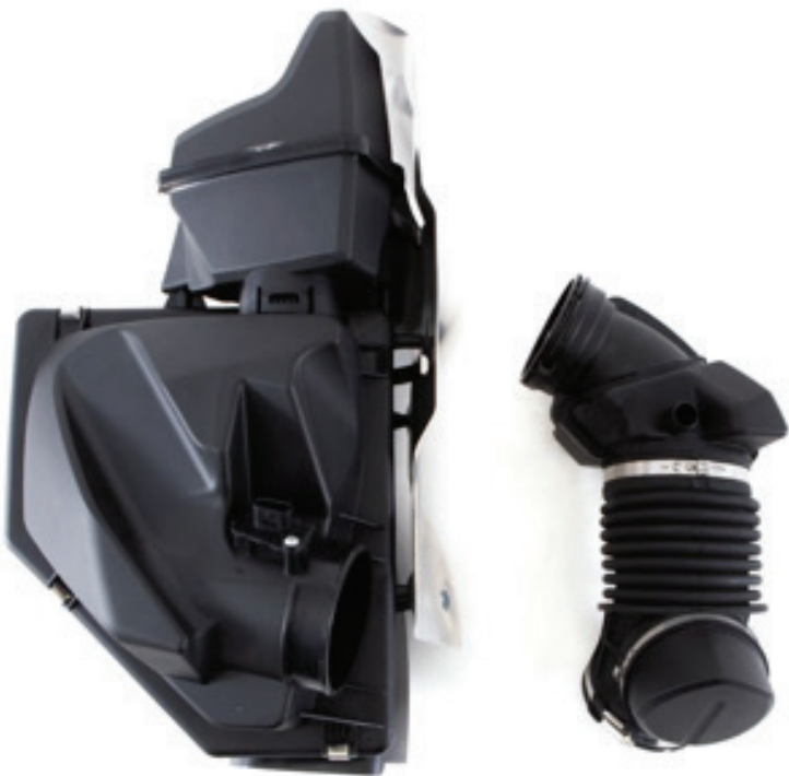
FIGURE 1: Stock intake.

The initial prototype we created replaces only the corrugated section of the stock intake tube. The rigid plastic section of the stock intake tube has two sound muffler chambers inside, a vacuum fitting, and is connected to the turbo snout by a quick-disconnect coupling design. Flow bench tests revealed that this section of the intake tube does not add flow restriction in the system, but it does dampen intake and turbo sound significantly. Based on this finding, we created a new tube design replacing this section, which produced much better sound quality.