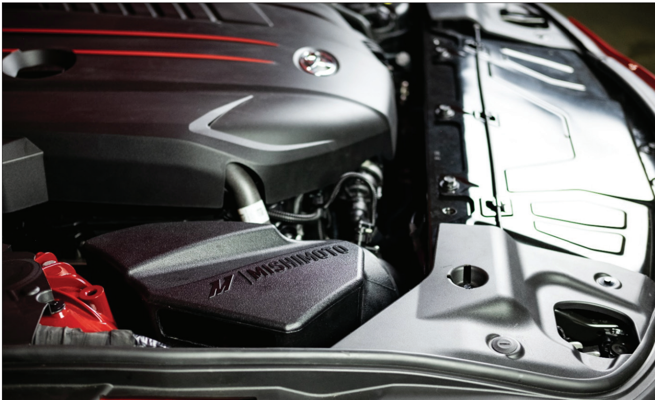
FIGURE 3: Mishimoto intake production sample installed.