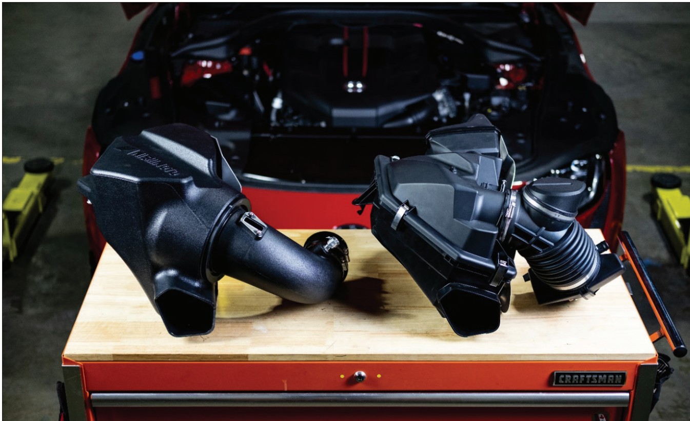
FIGURE 4: Mishimoto intake production sample (left) and stock intake (right).