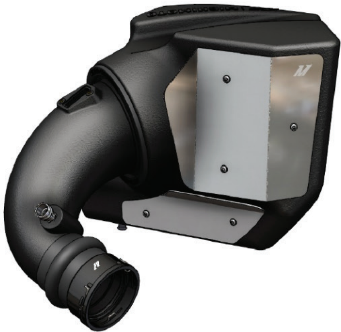
FIGURE 2: Mishimoto intake heat shield design.