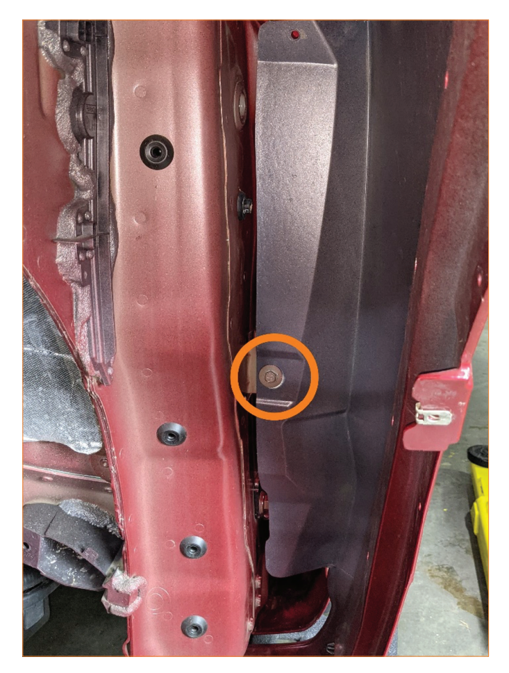
CONTINUED ON FOLLOWING PAGE

> Pull out the black foam located inside the fender and toward the door to expose the bolt underneath.