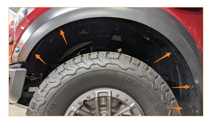
CONTINUED ON FOLLOWING PAGE

03. Remove the fender flare. Remove the 5x screws securing the flare to the wheel well liner, then pull the flare away from the fender to release the clips. Disconnect the marker harness before completely removing the flare.