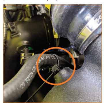
14. Plug in the IAT sensor connector

13. Secure the coolant hose to the Mishimoto intake tube with the provided tree clip zip tie.