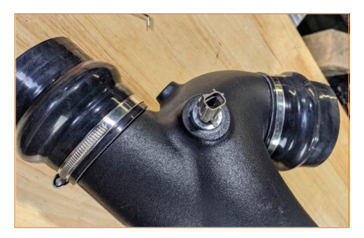
CONTINUED ON FOLLOWING PAGE

7. Transfer the IAT sensor from the stock intake tube to the Mishimoto intake tube. Attach the 2x silicone couplers to the intake tube, secure with 2x worm gear clamps (7mm socket).