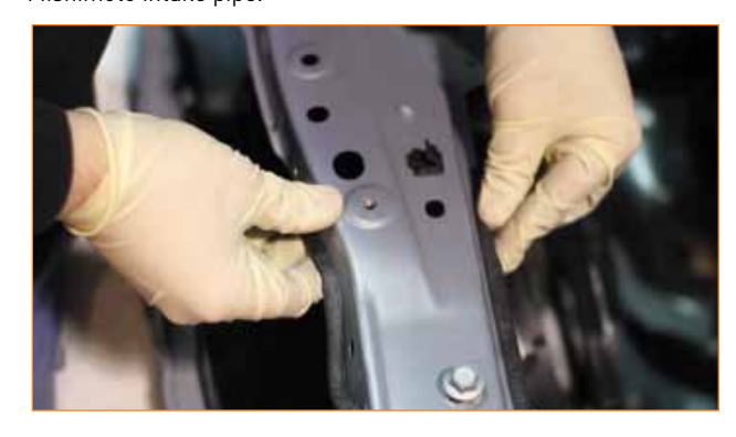
CONTINUED ON FOLLOWING PAGE >